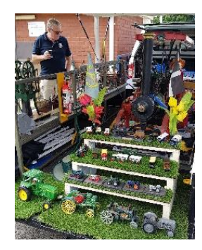
Ralph's trailer display.